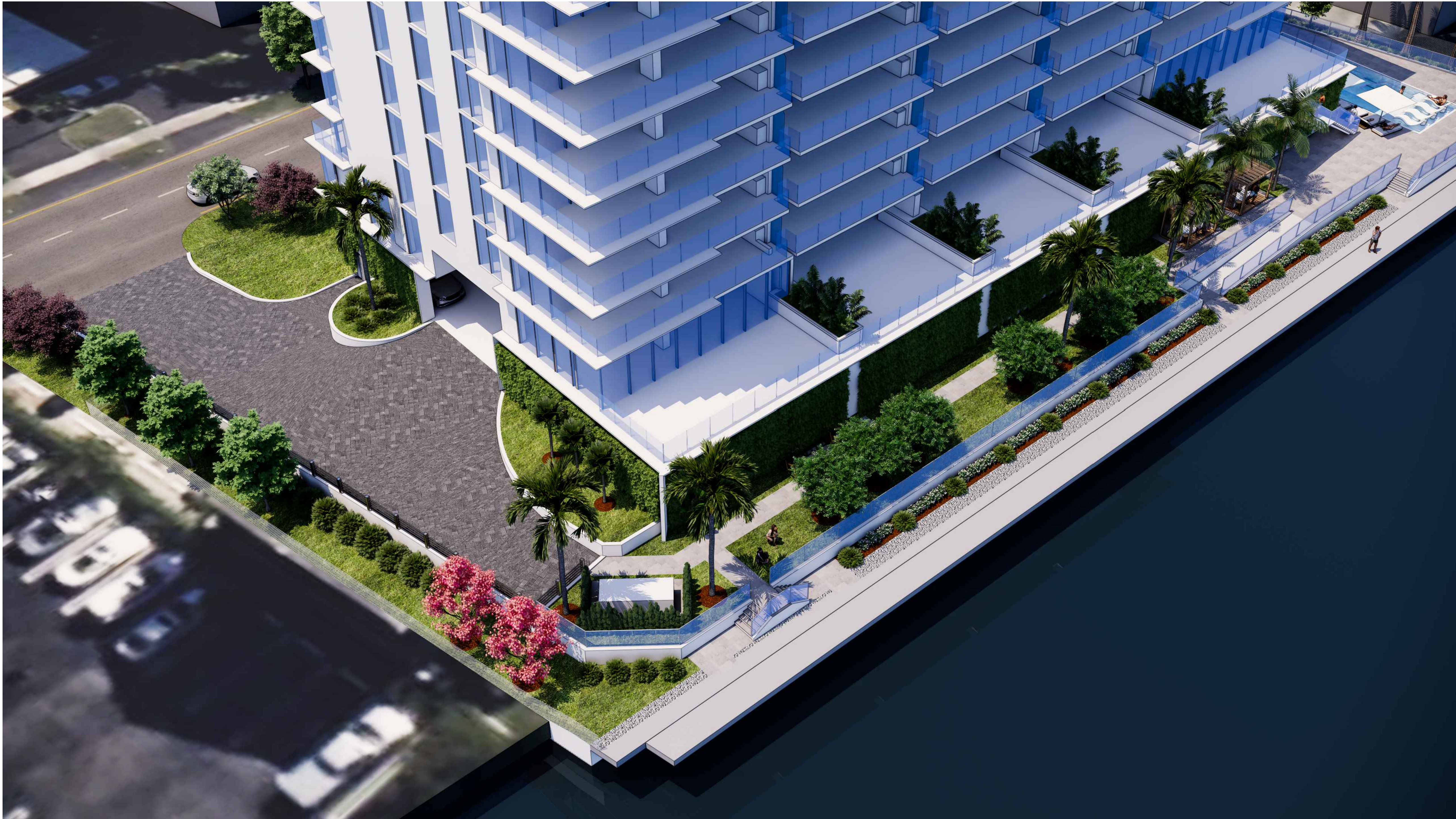
View from North-West Corner, looking South-East of the Staging Area